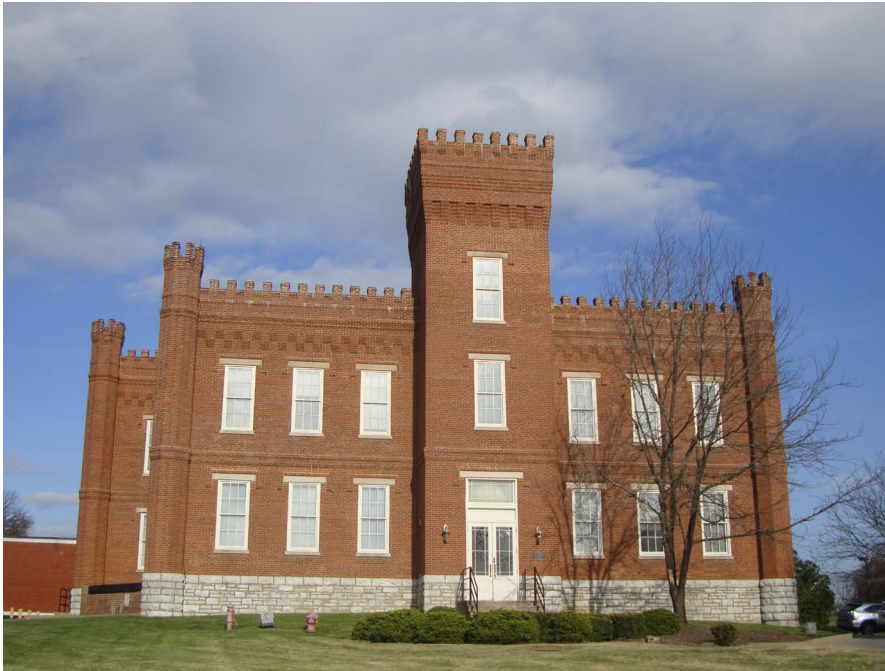
Jackson Hall at Kentucky State University honors John Henry Jackson.